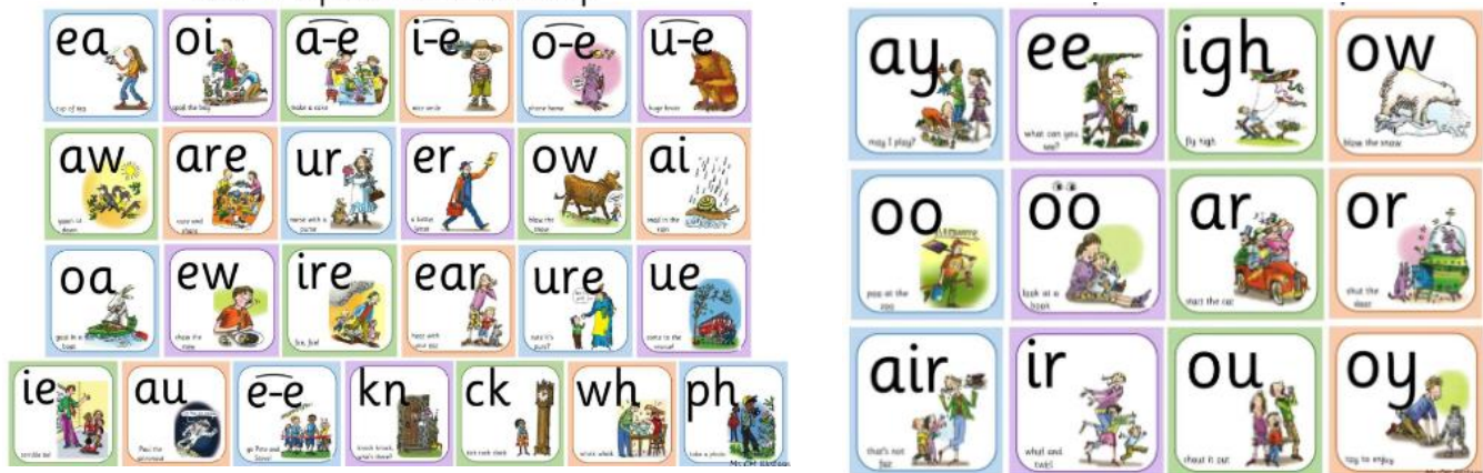
Set 3 Speed Sound Map