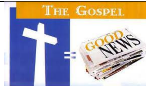
The Gospel is Good News!

'My peace I leave with you, my peace I give to you. Do not let your heart be troubled and do not be afraid.'