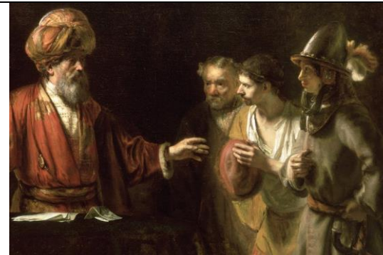
The unforgiving servant

'My peace I leave with you, my peace I give to you. Do not let your heart be troubled and do not be afraid.'