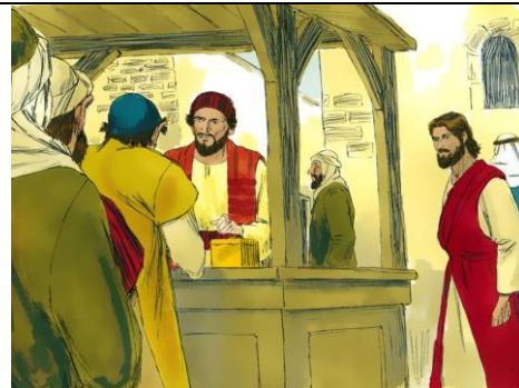
Matthew the tax collector