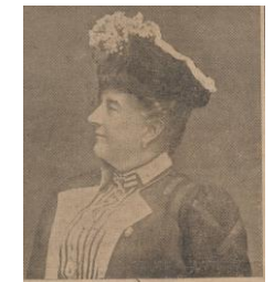
Ellen Chapman, a known suffragist.