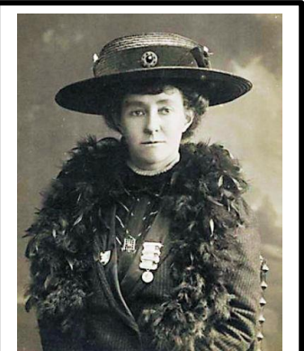
Emily Davison, a known suffragette.