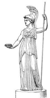
Athena, the Goddess of war.