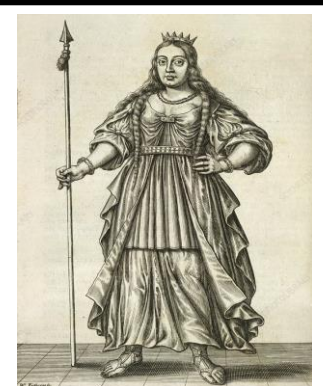
An illustration of Queen Boudicca.