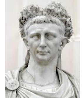
Emperor Claudius who successfully invaded Britain, 43AD.

The Romans expanded their empire . Achievements by the Romans such as public baths still exist today. The Romans were invaders . The Romans traded with other nations. Sources of evidence exist from archaeology.