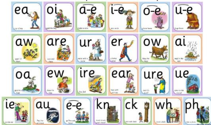
Set 3 Speed Sound Map