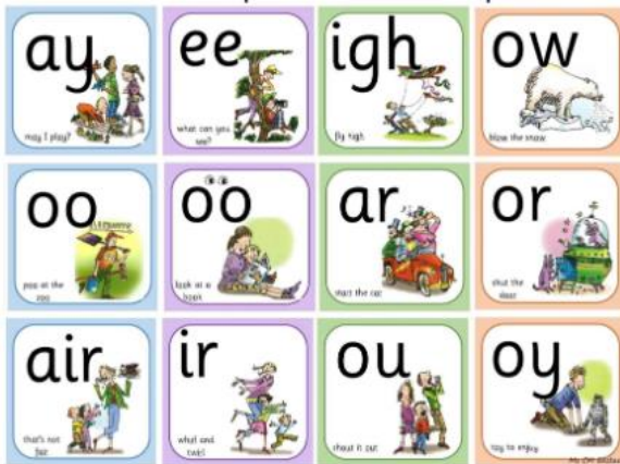
Set 3 Speed Sound Map